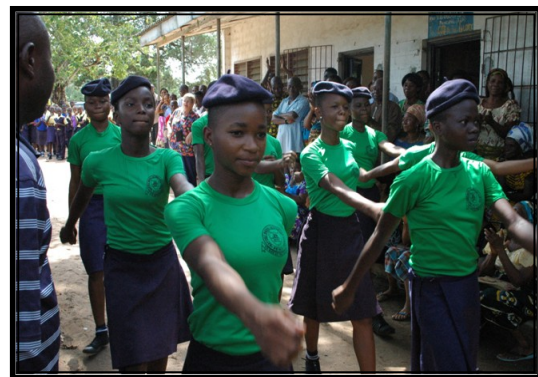
Students of Dr Kennedy Okere House in a parade