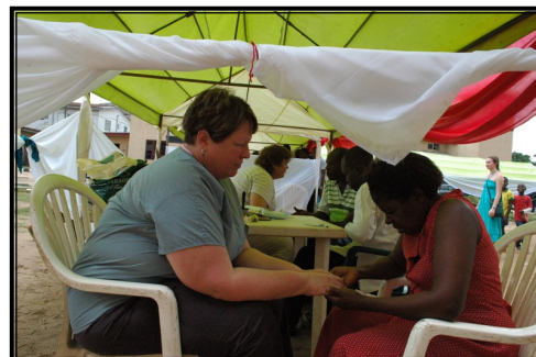
Prayer is the key to mission

When he announced the HIMM Mission 2011 in Nigeria captioned “Arise & Walk”, I indicated interest to participate as a non-medical personnel after reading through some of the newsletters and testimonies of what our good Lord have used and still using the group (Horizon International Medical Mission) to do in the life of people in Africa and the Caribbean. It gave me joy and hope that there are still people of a sincere heart that are into the dream which I have been asking God “how” this shall become a