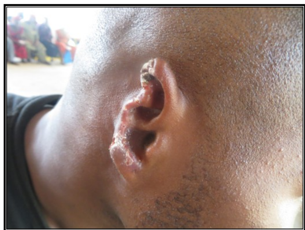
24 year old man with half external ear

A 24 yr old young man who had his external ear bitten off in a fight. He needs plastic surgery intervention to restore his external ear. He has been treated with antibiotic to deal with the infection. Can you help him?