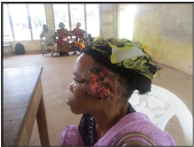
Ulceration on the face of 54 year old woman

This is a sad case of 54yr old woman who developed a small ulcer on the face 4 yrs ago. She thought the ulcer will go away without medical intervention.