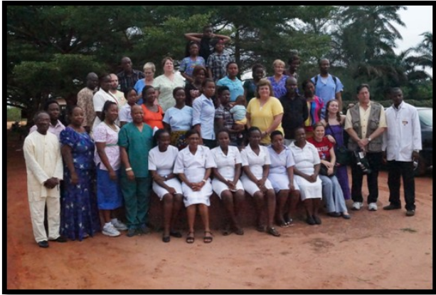
Group picture of HIMM team and the medical workers from Grace hospital in Eziamá