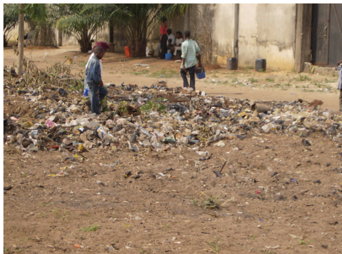
Children Scavenging Trash

Healing must be to the mind, body and soul to be complete