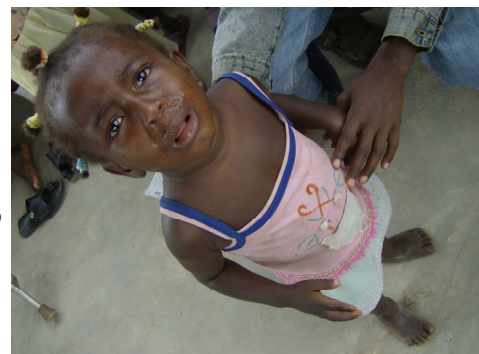
Little Girl with Vitamin A Deficiency

It is common to hear many patients who come to our mission clinics complain that they are suffering from blurred vision. This condition prevents some of them from working. The traditional rulers of the towns from which the people hail have requested for government assistance in curing, controlling or eliminating blindness due to cases of glaucoma, cataract or night blindness. Night blindness is a result of vitamin A deficiency. This is preventable in children by giving them vitamin A.