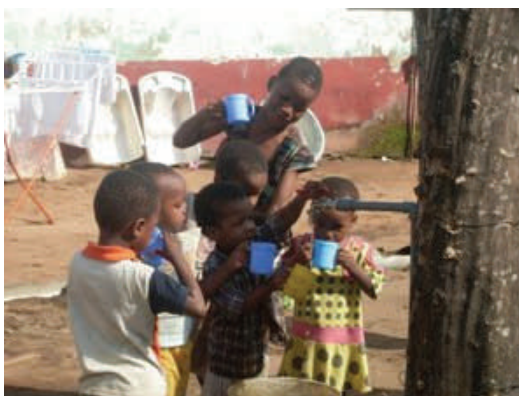
Orphan Kids Drinking from the River of Live Well