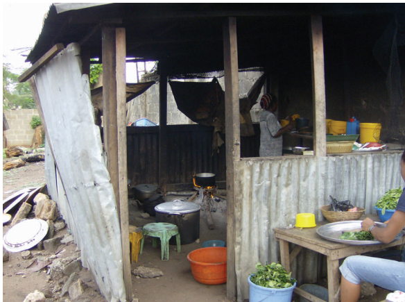
Orphanage Kitchen and Lady Cooking Outside