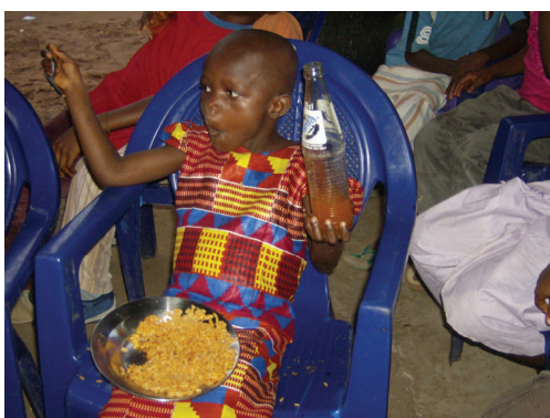
Children Enjoying Easter Lunch

Many do not have problems receiving gifts from friends and well wishers during Christmas or Easter in the developed world but the reverse is the case in the developing world. Some kid's do not have much to eat neither do they have people to spend time with at such special moment. HIMM was honored to host 200 children for the Easter. In the United States, part of the Easter celebration includes Easter egg hunts for the kids; in Africa, this fun filled process is not available for the kids to enjoy. Even if it is, the kids suffer more from lack of food and would prefer to have meal which they have not had before, or have not had for a long time. Feeding the kids and allowing them to sing and dance was enough to make them happy for the day.