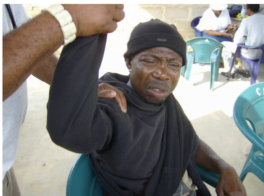
Man suffering from Arthritis and requesting for prayers