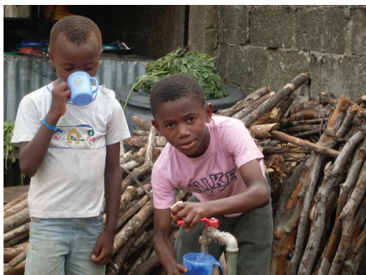
Orphan Kids Getting Water from the New Well System