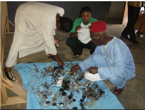
Patients Selecting Glasses

It is common to hear many patients who come to our mission clinics complain that they are suffering from blurred vision. This condition prevents some of them from working. The traditional rulers of the towns from which the people hail have requested for government assistance in curing, controlling or eliminating blindness due to cases of glaucoma, cataract or night blindness. Night blindness is a result of vitamin A deficiency. This is preventable in children by giving them vitamin A.