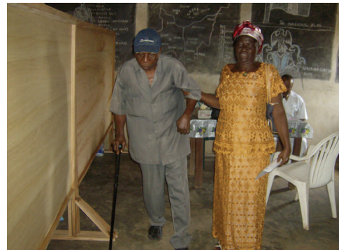
Patient Suffering from A Stroke