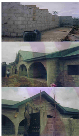
FIRST HIMM MEDICAL CENTER—CURRENTLY UN- DER CONSTRUCTION

HIMM is building a medical center in Ihiagwa, Owerri LGA, Imo State Nigeria. HIMM will use this clinic to achieve one of its major objectives, which is to set up local clinics and involve local healthcare workers and the government of the area in continuous care and management of patient health issues.